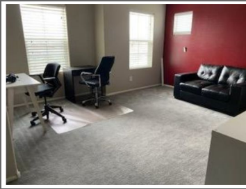
Relaxation Room is peaceful & quiet providing sanctuary from stress Residents may choose to read, work on computers or listen to quiet music with plugs for calm within acceptable boundaries.

We address resident's mental health needs, and their co-occurring physical and substance abuse needs by Carrying out individual treatment plans prescribed by medical professionals to target the unique mental, social and physical needs of residents. We have trained Behavioral Health Technicians and Paraprofessionals, dieticians, nurse (RN) and therapists offering their services as needed.